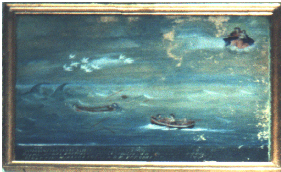
This 1890 watercolor painting by S. Portelli depicts the incident.

http://www.sharkmans-world.com/satt.html