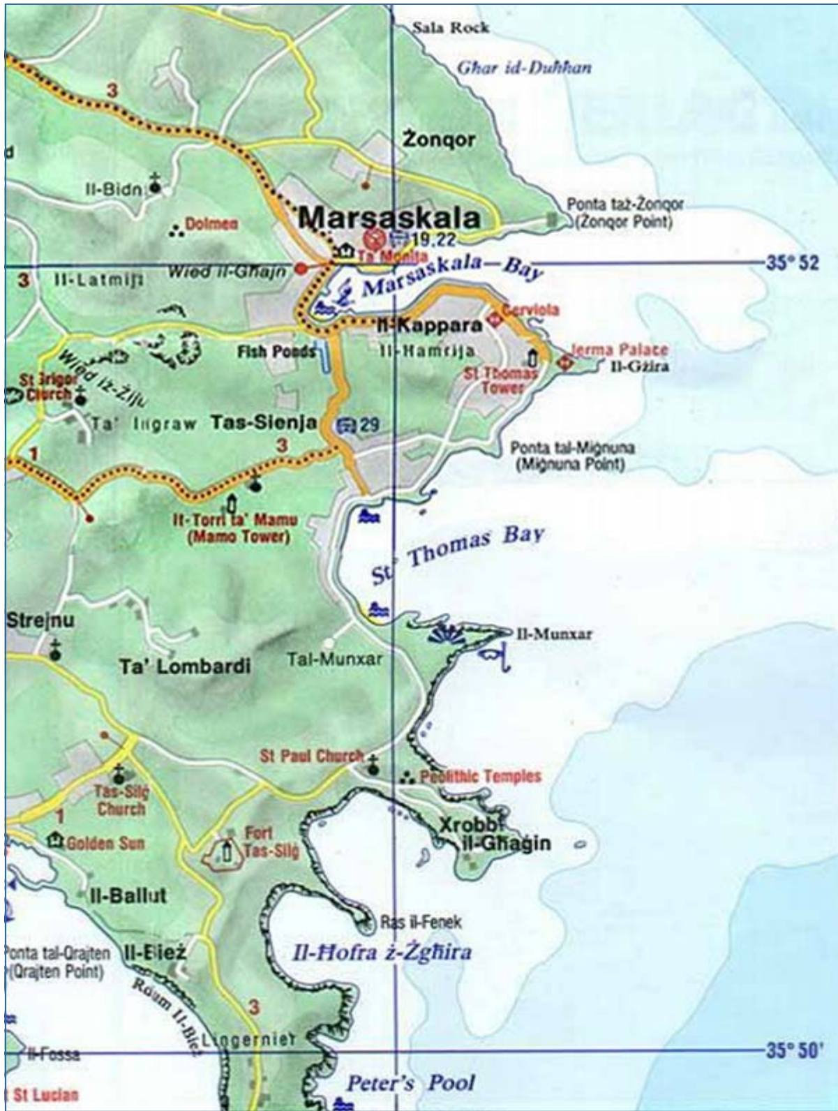
© Global Shark Accident File, 2005. All rights reserved. This report may not be abridged or reproduced in any form without written permission of the Global Shark Accident File.