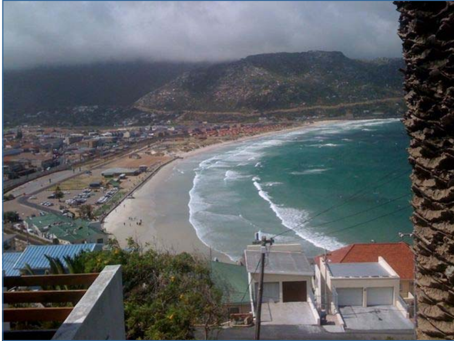
Photo taken from Fish Hoek mountain as the emergency vehicles arrive